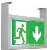
Double side ceiling adapter with canopy for Matrix