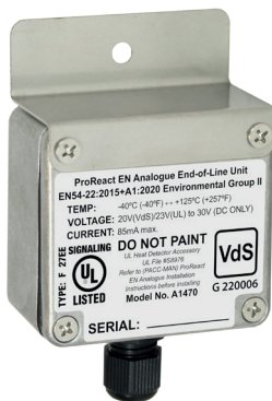
ProReact EN Analogue End-of-line Unit

The ProReact EN Analogue End-of-line Unit is compulsory in all ProReact EN Analogue LHD systems as it has a key role in the operation of the technology, allowing the control unit to detect a short circuit or open circuit in the sensor cable. It is small in size and is straightforward to be mounted on surfaces.