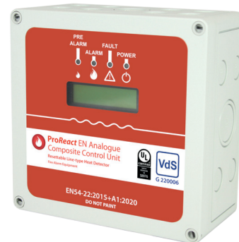
ProReact EN Analogue Composite Control Unit

More information relating to Thermocable's ProReact EN Analogue Composite Control Unit can be found in the product datasheet or installation manual, both of which are available on request.